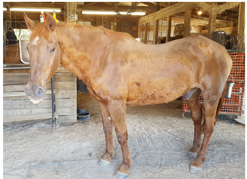
Durango (top) upon arrival at MFMN, and after returning to health.

"We have some wonderful horses that are trained and waiting to be adopted."